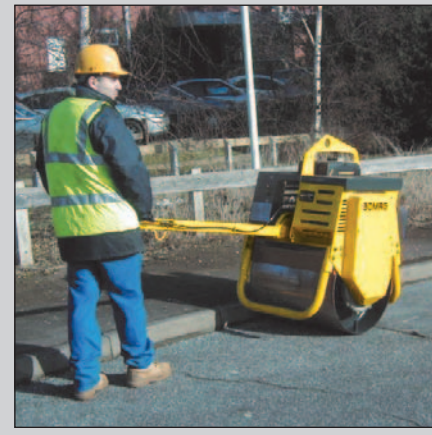
BW 71 E: By standard with single-point suspension.