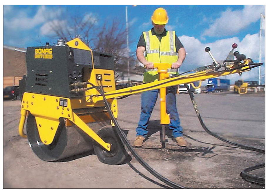
BW 71 EHB-2 with hydraulic breaker and supporting wheel (optional).

The BW 71 EHB-2 single-drum roller is available with a hydraulic breaker option. This feature expands the uses of the unit. The rollerbreaker model is particularly popular for