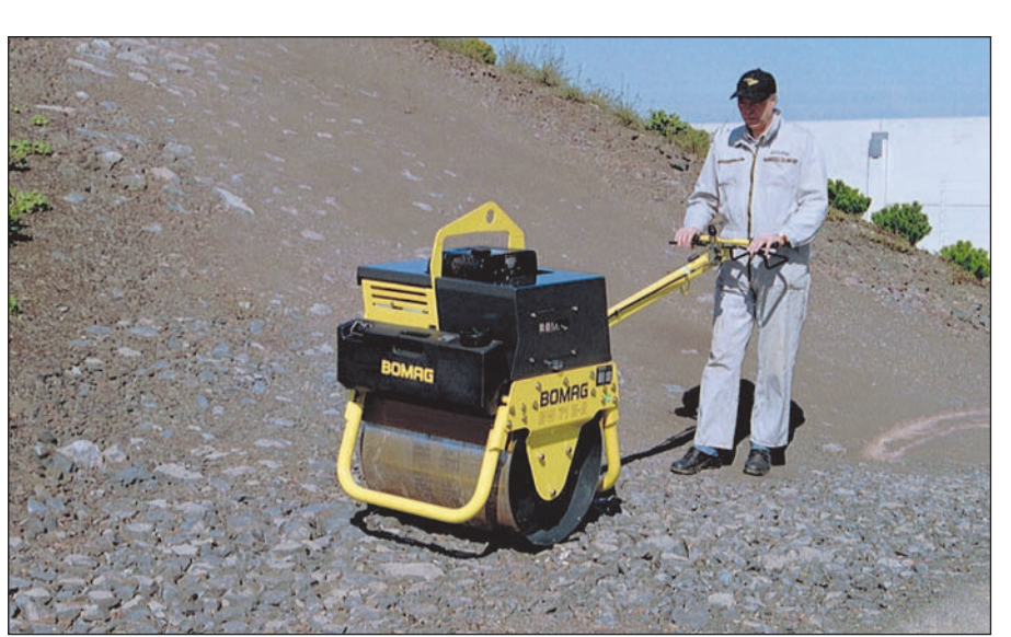
Versatile application: BW 71 E-2. Optionally also available with supporting wheel.