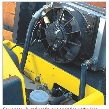
For longer life and continuous operation under high loads the roller-breaker is equipped with an additional