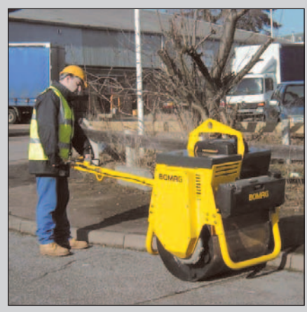
Standard with water sprinkler system.