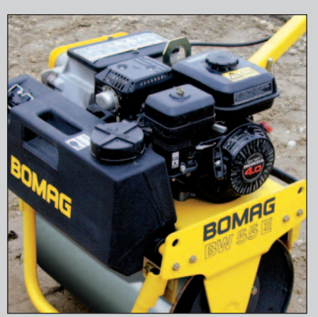
Proven on over 1000 units – the Honda GX 120 on the RW 55 F